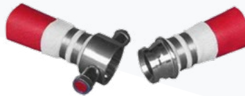
BS Coupling wired in