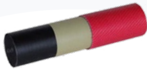
Hose Construction: Jacket, NBR- synthetic adhesive and NBR -synthetic rubber