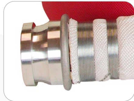
Wired in hose