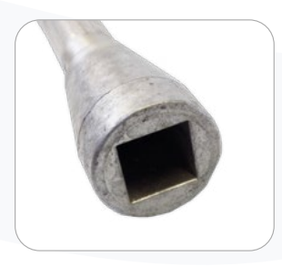
35mm square socket spindle key